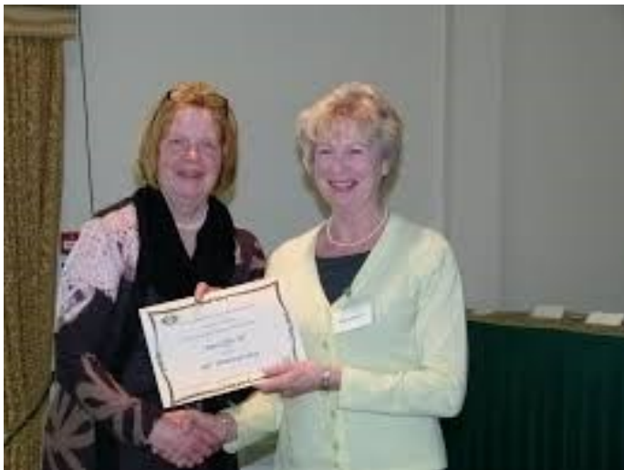
Certificate presented at the Spring Council

Celebrating the 80th Anniversary March 2013