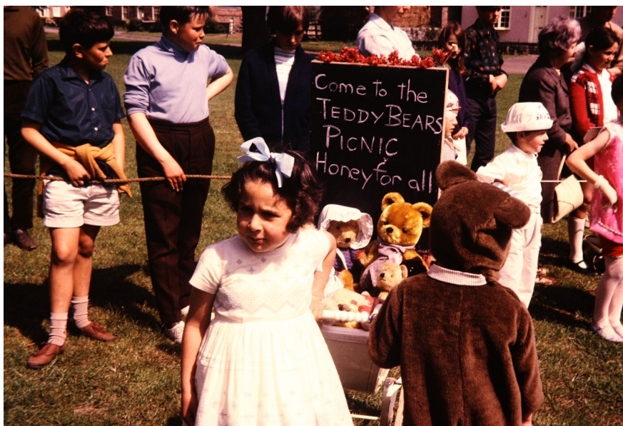
Fancy dress competition 1967