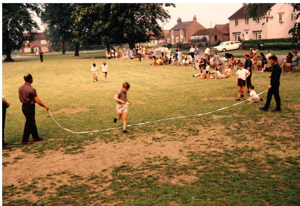
They're off! Sports Day 1969