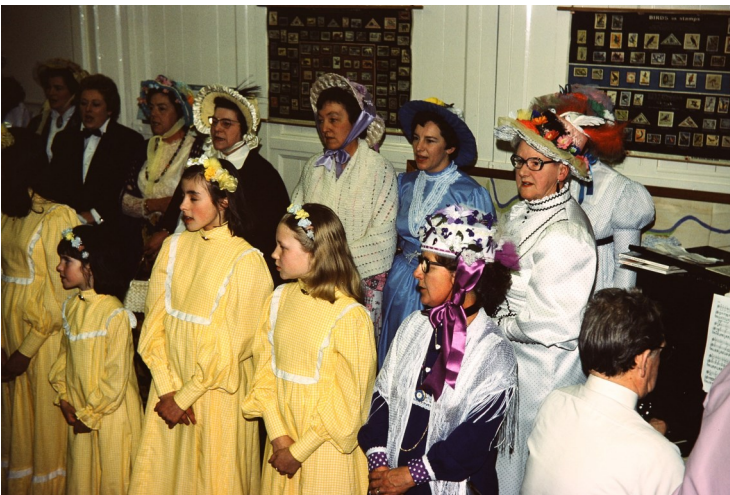
Roecliffe Follies 1976