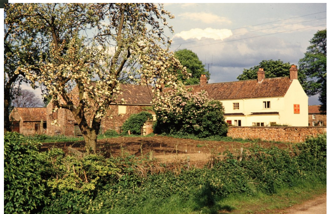
The field behind The Crown before Roecliffe Park was built