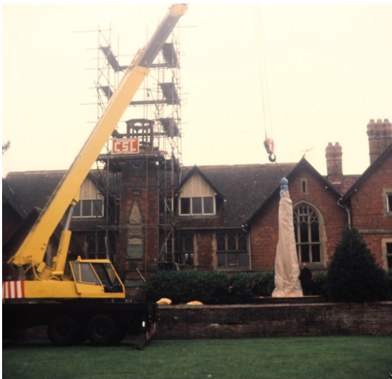
The school spire is replaced