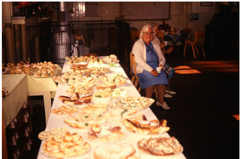
The celebratory buffet 1971