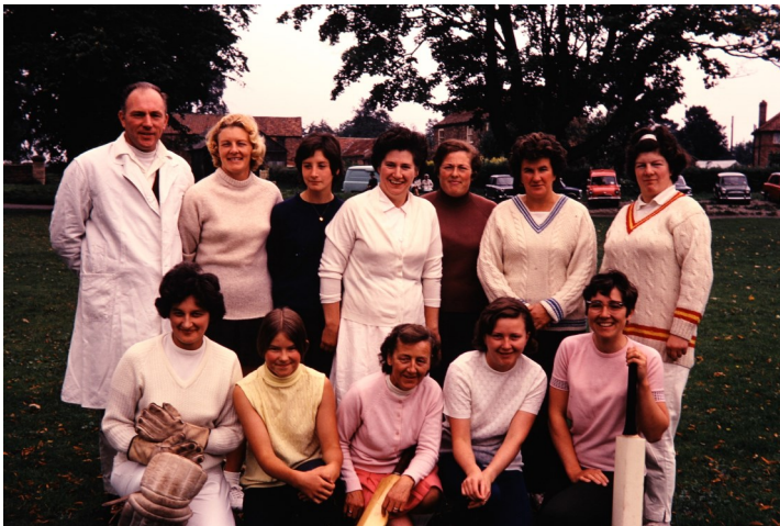
The ladies' Cricket team, formed in 1965