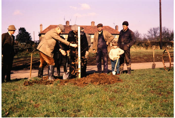
Planting the Runners-up tree in 1969