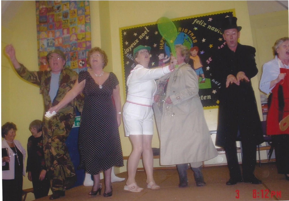
Christmas party 2006