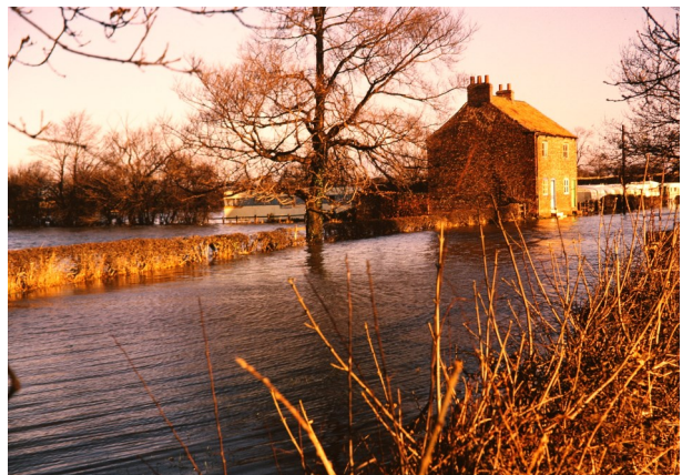
Bar lane before the road level was raised, 1966