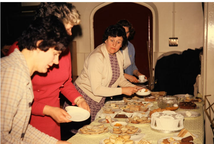
A typical WI buffet 1971