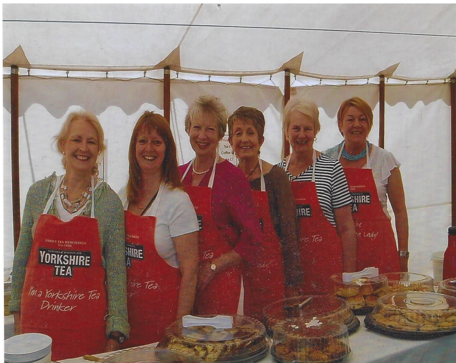
The WI Tea Tent Aldbrough & Boroughbridge Show 2012