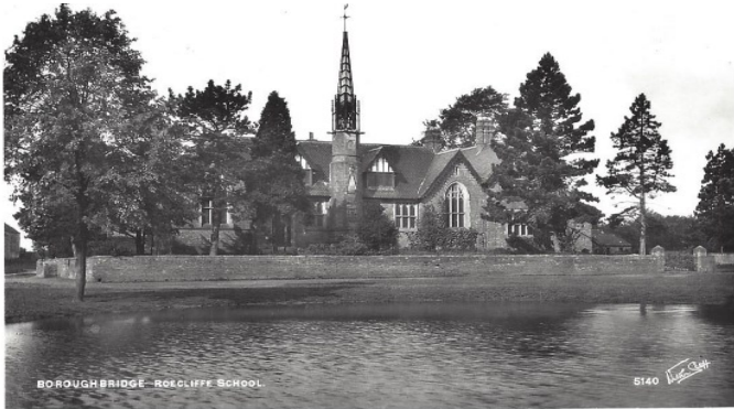
The pond in front of the school, filled in in 1959