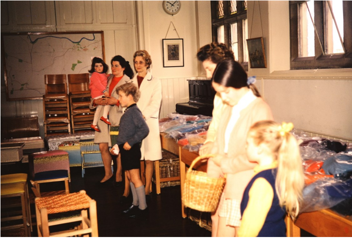
One of the sales for the blind, 1971