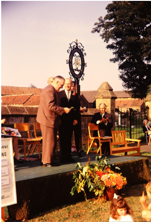
The winner's Trophy presentation in 1971