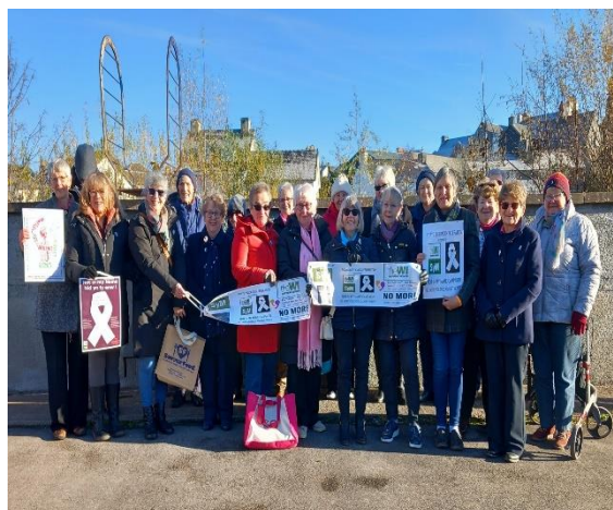
Members of Powys Brecknock Federation