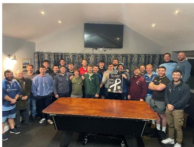
Narberth Rugby Club

Members of Powys Brecknock Federation took part in a White Ribbon walk led by Powys County Council and recruited Brecon Choir and Penlan Bowls in Brecon in pledging their support.