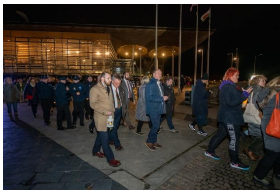
2023 Candlelight Vigil