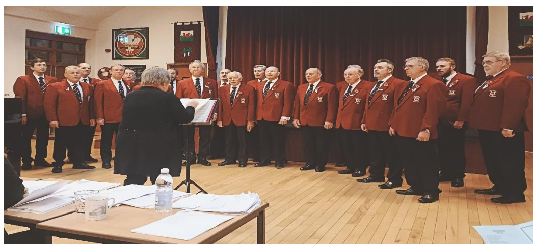
Brecon Male Choir