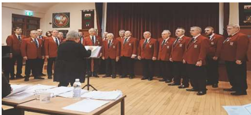
Brecon Male Choir