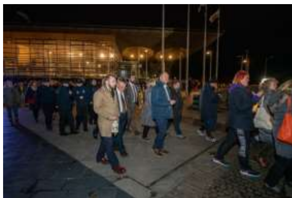
2023 Candlelight Vigil