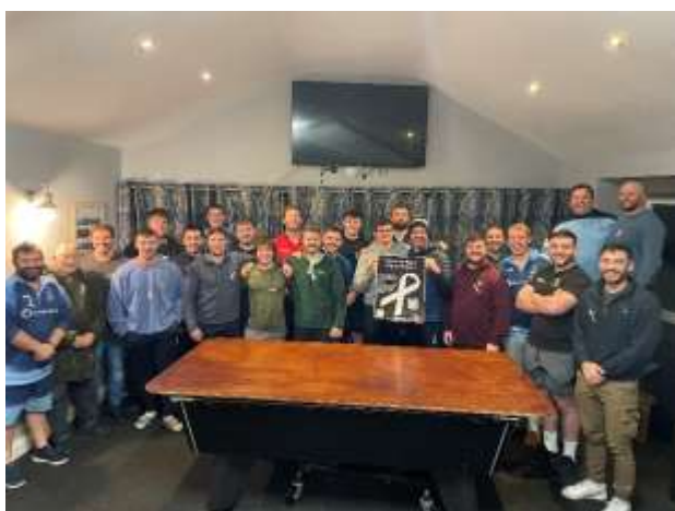
Narberth Rugby Club

Members of Powys Brecknock Federation took part in a White Ribbon walk led by Powys County Council and recruited Brecon Choir and Penlan Bowls in Brecon in pledging their support.