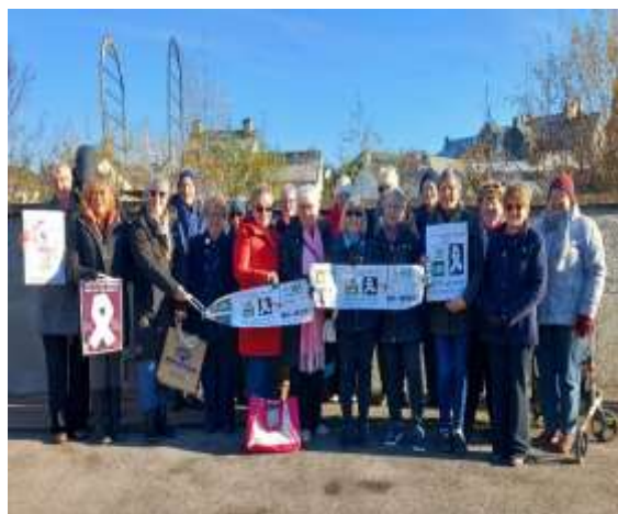
Members of Powys Brecknock Federation