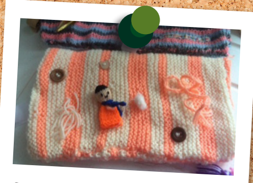
Sensory band crafted by a member of Wanstead WI