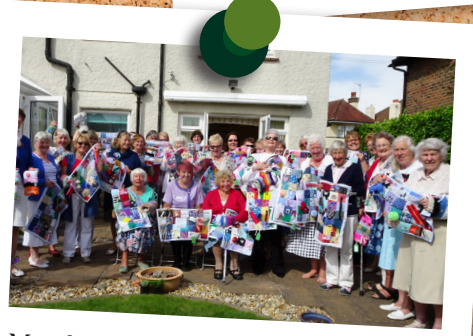
Members of Felpham Evening WI handing over 24 sensory bands and 30 mats to St Richard's Hospital