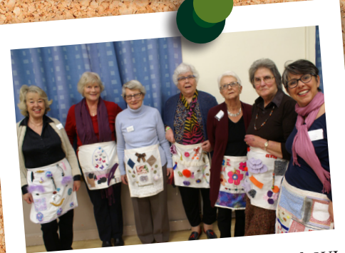
Members of Teignmouth WI with their fidget aprons