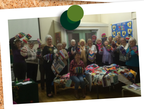
Halton WI's sensory band presentation