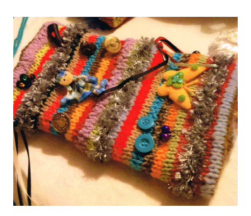
Sixpenny Handley's WI's craft club made 40 sensory bands for two local specialist nursing homes